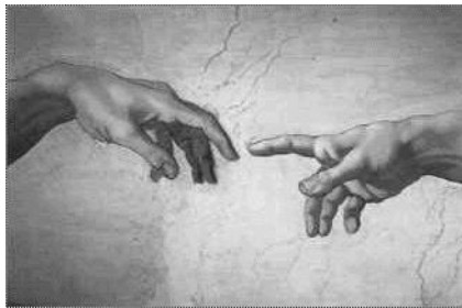
This picture is Michelangelo’s ceiling painting, The Sistine Chapel , in the Vatican in Rome, Italy. This is from the painting depicting the creation of Adam. The hand of God is on the right and the hand of Adam on the left. (Painted sometime between 1508-1512.)

To be fully human is to be wealthy and successful. (Fully human means to reach for the highest potential within.) We have inherited wealth and success from our fathers: God – our Heavenly Father and Creator; Adam – our earthly father who was the first human to bear the image of God; and Abraham – our spiritual father of faith. Wealth is indeed a human inheritance. Claim your inheritance now by fully living and letting God work in you and through you.